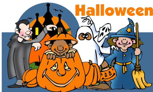
Photo Booth & Haunted House